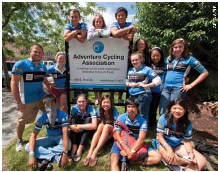
"4000 Miles, 2 Wheels, 1 Cause." Young cyclists with the organization, Illini 4000 for Cancer, are all smiles when they stop by our headquarters during their ride from New York City, NY to San Francisco, CA.