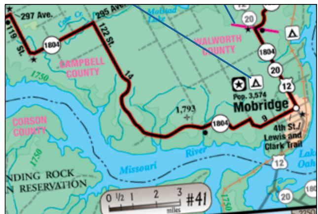
Adventure Cycling grew and updated our route network to 38,158 miles, with a new map set in Washington State and 38 revised map sections.