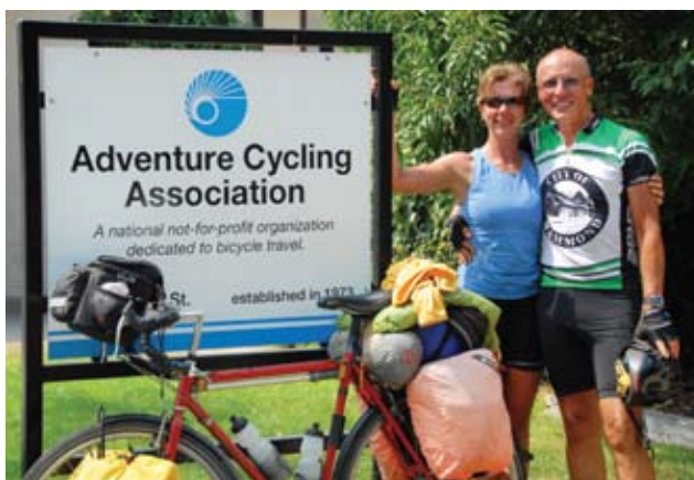
In 2008, Adventure Cycling served tens of thousands of cyclists with routes, maps, information, advocacy, and more.