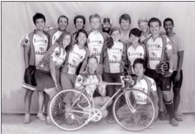
Illini 4000 for Cancer 2008 Team (IL), New York to Seattle – Raised a whopping $50,000 for The American Cancer Society and $500 for Camp Kesem.

Gold: GuidedCycling.com • Pedal The Planet • Saris Cycling Group • TeamEstrogen.com • Terry Precision Cycling Silver: Bike Friday • Cascade Huts • Clientek • Jacob North Companies • Safe Bicycling Innovations Inc Bronze: Anderson ZurMuehlen & Co.