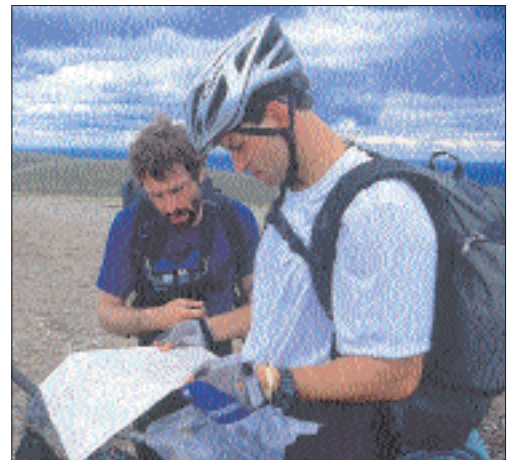
Hellbikers navigate using only a topographic map — and the view in front of them.

"No," he said. "You don't know how lucky we are. What