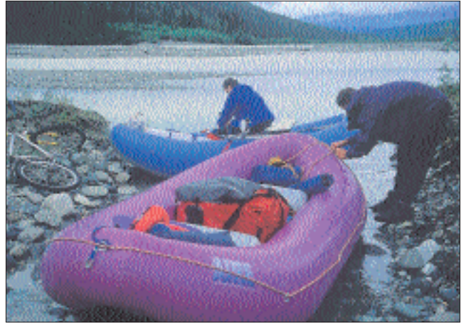
Hey the hard part is over! Now the hellbikers had only to raft the Talkeetna River — and its gut-churning rapids.

Over the next two days, we shot rapids, capsized the