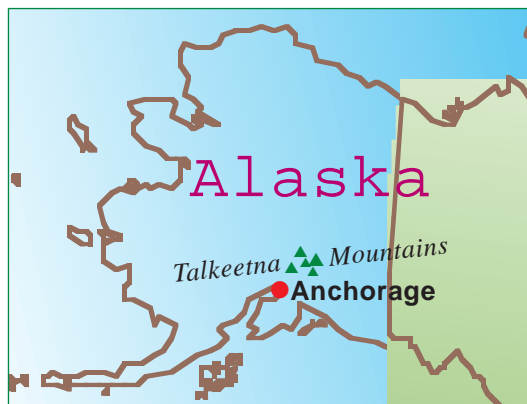
The Talkeetna River country is just north of Anchorage.