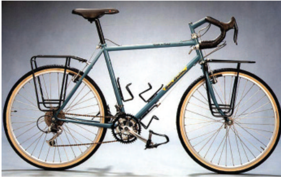
Bruce Gordon's Rock 'n Road.

The recumbent buyer faces a plethora of choices, and the differences among the various designs are very real. You can have your handlebars in front of you, or underneath your seat (my favored position, but a small minority in the marketplace). You can have a long wheelbase, a short wheelbase, or one in between. And these wheelbases vary by many inches, enough to make a real handling difference. (The millimeters by which