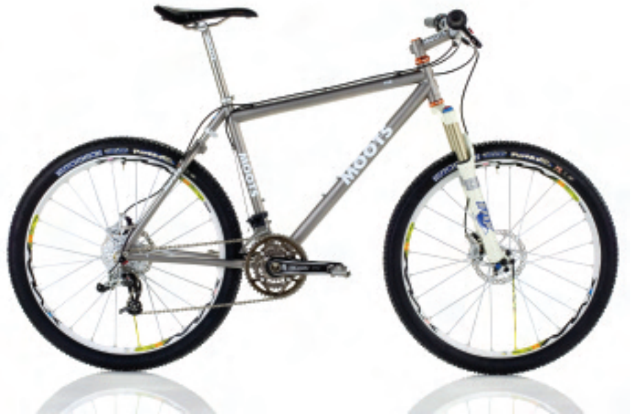
The Moots YBB.

delightful. Your companion is within easy conversing distance. Every pedal stroke is teamwork, which, when done well, makes you gush with good vibrations. The bigger, heavier bike is more stable over bumps, and