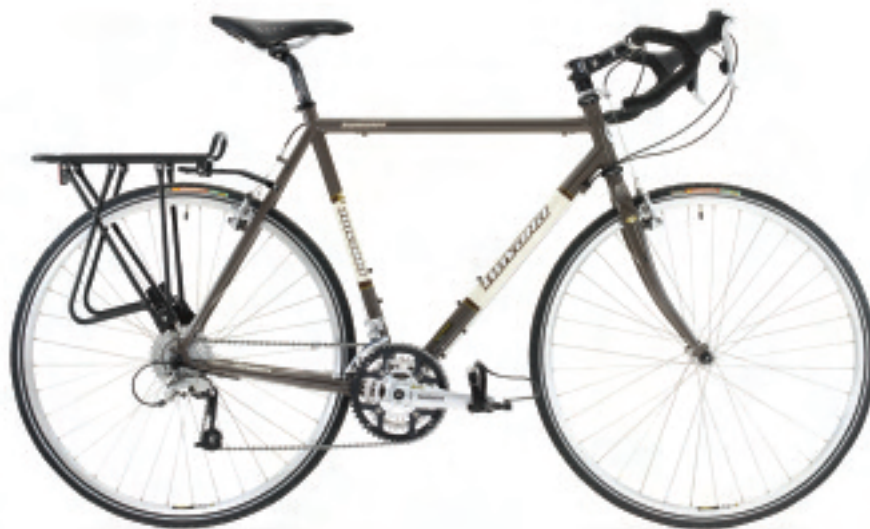
REI Novara Randonee.

Four years ago, Specialized reignited the choices for this kind of rider with the Sequoia, which is pretty much a hybrid