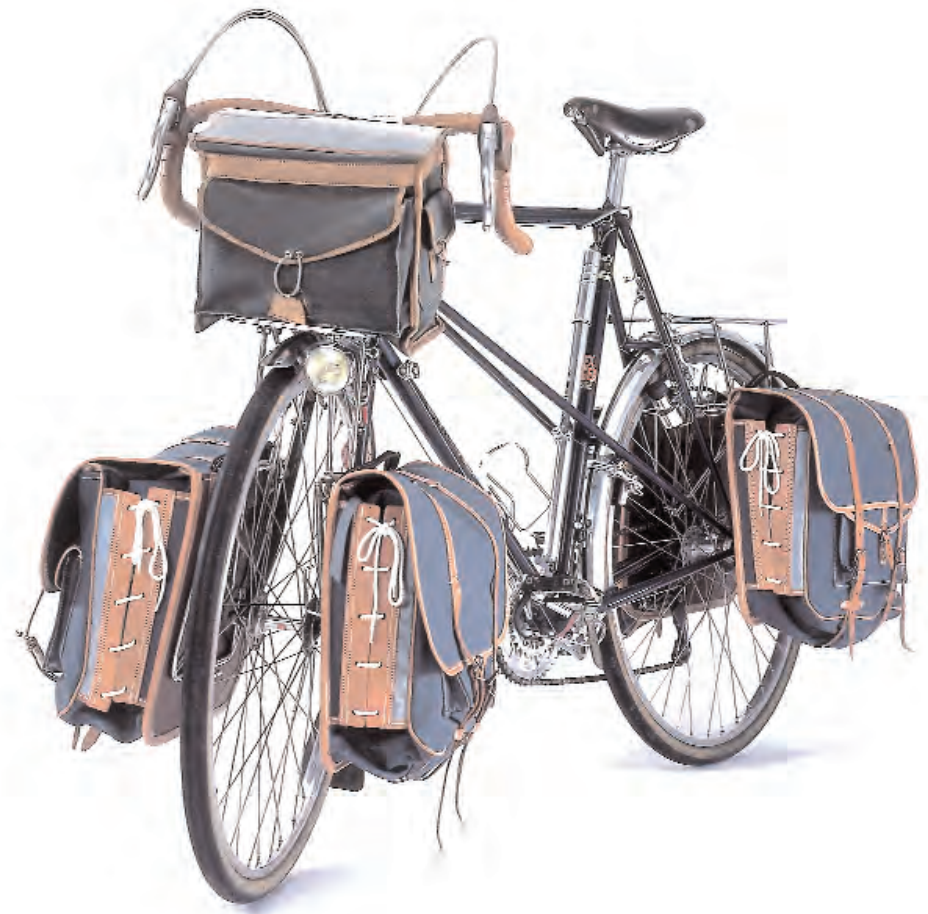
The French “constructeur” bikes have not changed much in recent decades. The 1985 reinforced frame and sturdy low-rider racks of this 1985 Alex Singer allow riding no-hands with more than 50 lbs. of luggage.

As a result, most fully equipped touring bikes have brackets, sliders, and clamps. Racks sit high above the wheels or tilt one way or the other. Many bicycle tourists forgo useful parts, such as fenders and lights, because they are a hassle to mount on their bikes. Not only do the resulting bikes lack the elegance of racing bikes, but each slider or clamp is a weak point leading