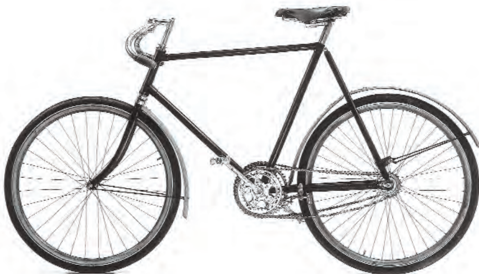
Early cyclotouring bikes used many different gear changing mechanisms. This 1910 “La Gauloise” has two chains. Either chain can be engaged, giving two gears. Two additional gears are obtained by placing the chain by hand on the second chainring/sprocket combination on each side.

followed the 1976 Bikecentennial diminished when mountain bikes caught much of the limelight in the 1980s. More recently, the race victories of Lance Armstrong have focused the “road bike” market on racing bikes. Most big makers have dropped touring bikes from their lines. A few continue to offer them, knowing that there is steady demand for these machines. While any bicycle can be used for touring, experience has shown that it