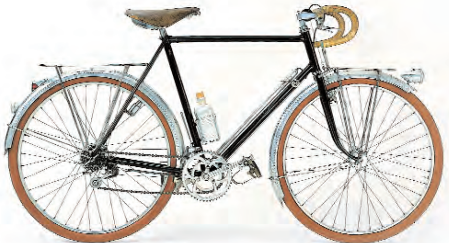
“Camping” bikes like this 1948 René Herse were equipped with special geometries, sturdy racks made from steel tubing, as well as integrated lights and fenders. A rear drum brake allows descending unpaved mountain passes, which requires constant braking, without overheating the rim.

In 1940s France, a top-of-the-line custom bicycle was a status symbol comparable to a sports car today. At the time, racing bikes were relatively crude, so the fully integrated touring bikes captured cyclists’ imagination. Features like chain-rests that allowed removing the rear wheel without touching the chain, light-