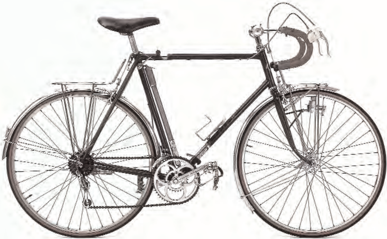
This René Herse “coupler” bike was ordered by a member of the International Bicycle Touring Society in 1971. It features quick releases not only for the frame, but also the stem. Shift levers under the seat simplify the disassembly procedure, which takes less than 2 minutes.

a variety of reasons, including a lack of spare time and the more widespread availability of automobiles. However, some Americans did travel by bike. Many of these early American bicycle tourists were associated with the youth hostel movement. As time went on, American bicycle tourists ventured further. In the 1950s, Dr. Clifford Graves founded the International Bicycle Touring Society and led tours in Europe and the United States. Because American makers offered few bikes suitable for touring, many experienced American bicycle tourists looked to Europe for equipment. High-end touring bikes were made both in France and Britain, and bicycles from both countries were imported into the United States. Each of these two countries had developed a very different approach to touring bicycles.