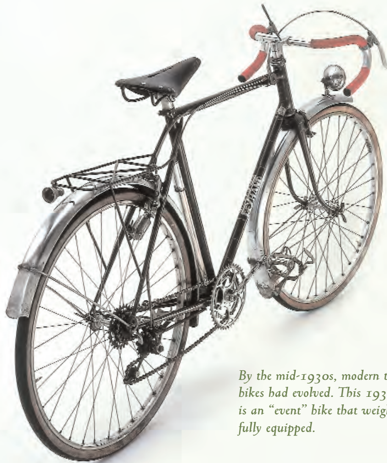
By the mid-1930s, modern touring bikes had evolved. This 1936 Reyhand is an "event" bike that weighs 24 lbs. fully equipped.

ing bikes offer better value than ever. Today, even inexpensive bikes shift well, have frames rigid enough to carry a load, and are suitable for touring. Compared to bikes costing twice as much, the main trade-off is durability. Choices at the lower end of the market include the Surly Long Haul Trucker ($420, frame only), Bianchi