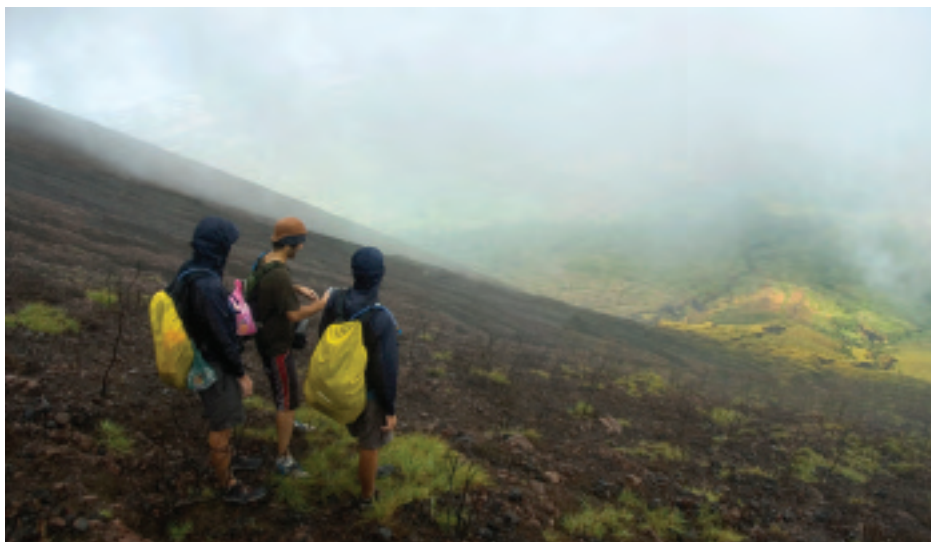
A sunny interlude. A slight break in the clouds reveals the jungle below Volcán Concepción.

This is where we left Walter to head for Isla de Ometepe. On our last day in the