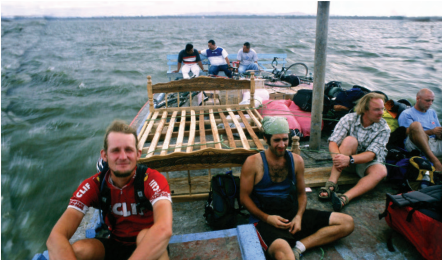
Onward to Ometepe. Both locals and travelers cross the waves of Lago de Nicaragua on the hour-long ferry ride to Isla de Ometepe.

country, we decided to stock up on nacatamales , a Nicaraguan dish of cornmeal, meat, vegetables, and herbs wrapped in steamed banana leaves. Traditionally served on weekends, its taste had evaded us since León.