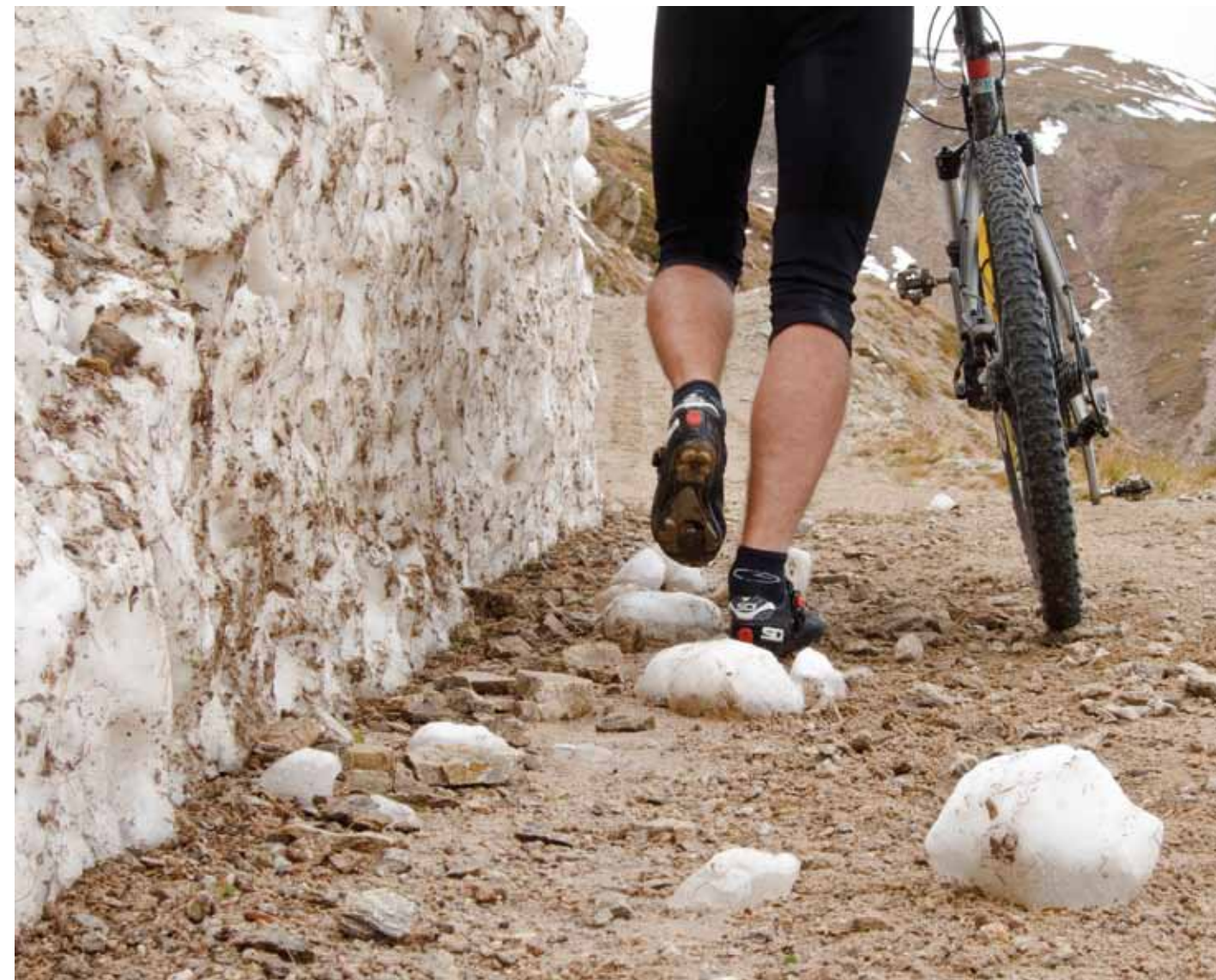
Chaschauna Pass. The route was often so steep between Italy and Switzerland that walking was necessary.

might be a bit tougher than planned comes early on the train ride from Zurich. It’s our first view of the Alps, and not only are they shockingly large and steep, they’re covered with snow.