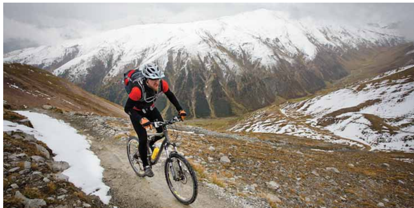
Climb to the sky. Crash gets out of his saddle to keep momentum going on one of many ascents along Alpine Route 1.

The first clue that our ride in Switzerland