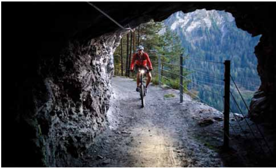
Through the mountains. One of many carefully-carved tunnels on Alpine Route 1.

road, into the lower valley, we ride side by side, giddy from having made it over Chaschauna. We're covered in mud and laughing, hooting, and catching simultaneous air off any berms and ripples that come along. Severin had been right. This was a victory for young males everywhere, and, er, not-actually-that-young-anymore males, too.