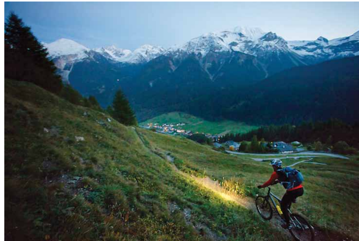
Night lights. When caught riding into Santa Maria after dark, the guys were sure glad they brought their bike lights along.

For more about bike travel in Switzerland, check out our web-exclusive "Traveling Solo Swiss Style" by Gigi Ragland at www.adventurecycling.org/soloswiss .