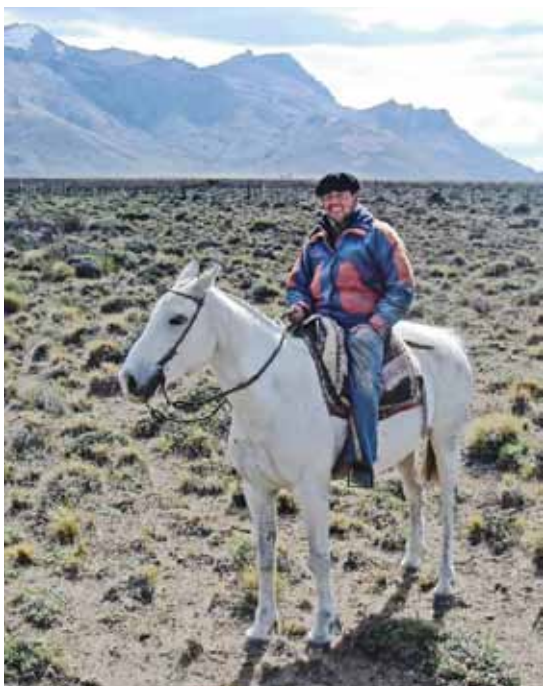
Open country. Friendly puesteros roam the land.