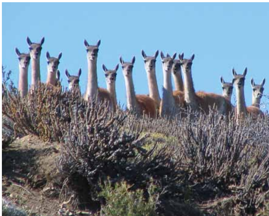
Curious onlookers. Even Patagonia's guanacos found the railbikes interesting.

second day than at any time in my life. At one point, there were all these birds in the air and guanacos crossing in front of and around us and Patagonia hares running across the track. They looked like a bobcat