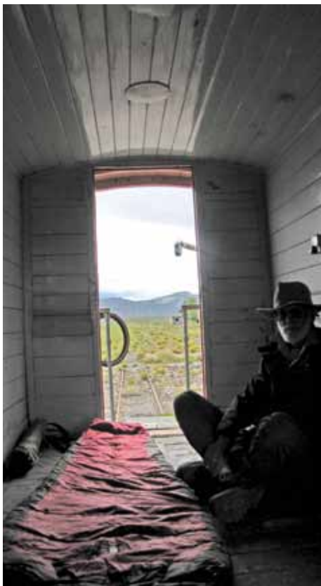
Local accommodations. An abandoned baggage car in Fitalancao provides a perfect sleeping solution.

The four met in Buenos Aires in late November of 2009, their railbikes stowed in suitcases, prepared to ride across Patagonia. "Everything we had when we left the plane in Buenos Aires, we took with us on the bikes," Dick explained. "First, we had a 24-hour bus ride to Esquel, the jump-off site.