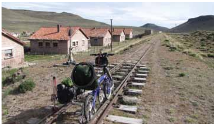
A bridge too far? Canyon winds challenged the nerves of the riders. Rest stop. The village of Ojo de Aqua provided respite for the riders.