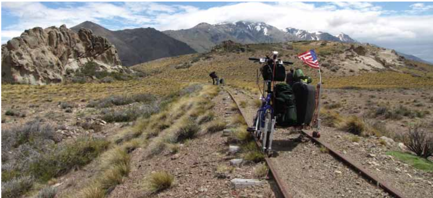
Patagonia dreaming. Top Left: A future puestero. Top Right: A satellite phone proves useful on the rails. Above: Carrying 90 to 100 pounds of gear prevented high winds from sweeping the railbikes off the narrow-gauge rails of the La Trochita.

allowed to ride in the locomotive cab of the old American-built Baldwin engine.