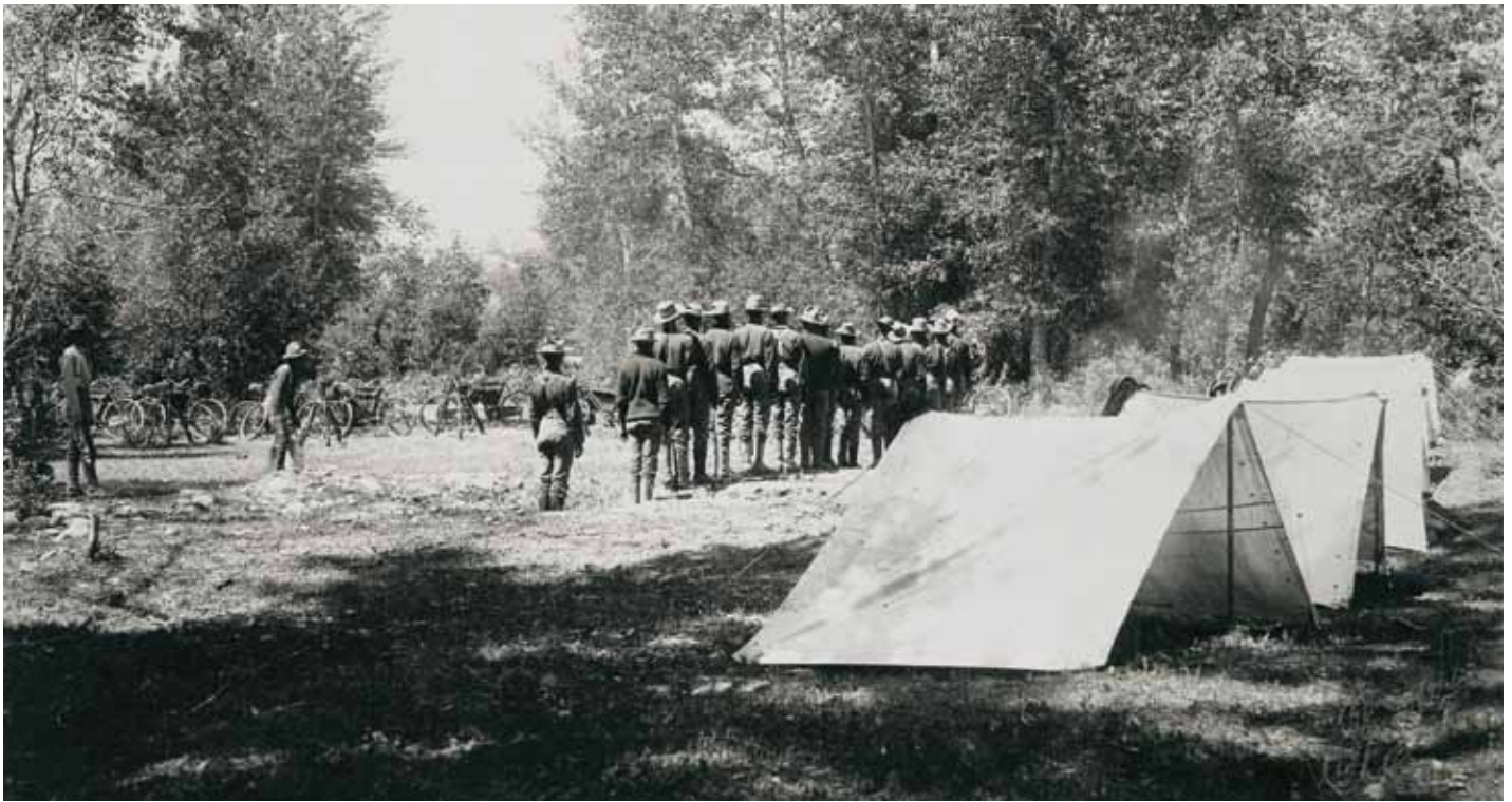
The 25th Infantry Division Bicycle Corps makes camp. A scene any self-contained cyclotourist would recognize.