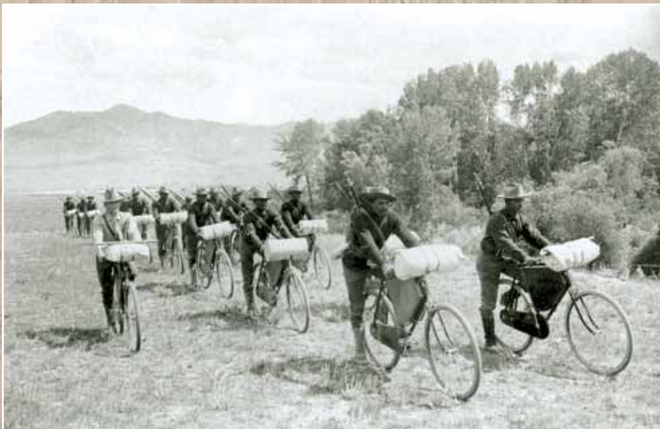
Outside Missoula. The Buffalo Soldiers of the 25th Infantry Division in bicycle formation.

The Buffalo Soldiers, as the black infantrymen were known, left Fort Missoula at 5:30 AM on June 14, 1897, riding donated Spalding bicycles. They arrived in St. Louis 34 days later on July 24 to a grand reception in Forest Park, equivalent in that city to New York's Central Park. The Buffalo Soldiers had averaged nearly 56 miles per day over the most primitive roads imagin-