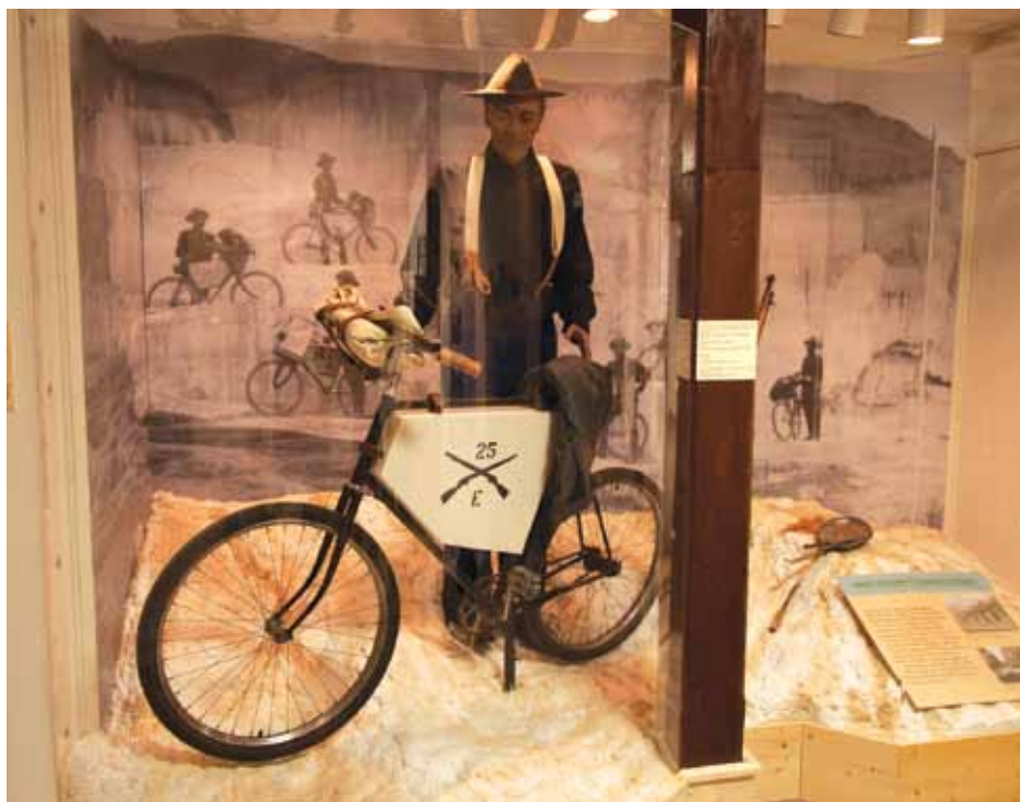
Almost the real thing. A current display at the Historical Museum at Fort Missoula. Unfortunately, none of the original Spalding bikes are in existence today.

desirous of organizing at this post a detachment of cycle infantry. I have taken