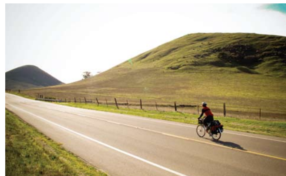
The long haul. A good touring bike can last for a lifetime of riding.

Torsional rigidity means the frame doesn't much like to twist in response to