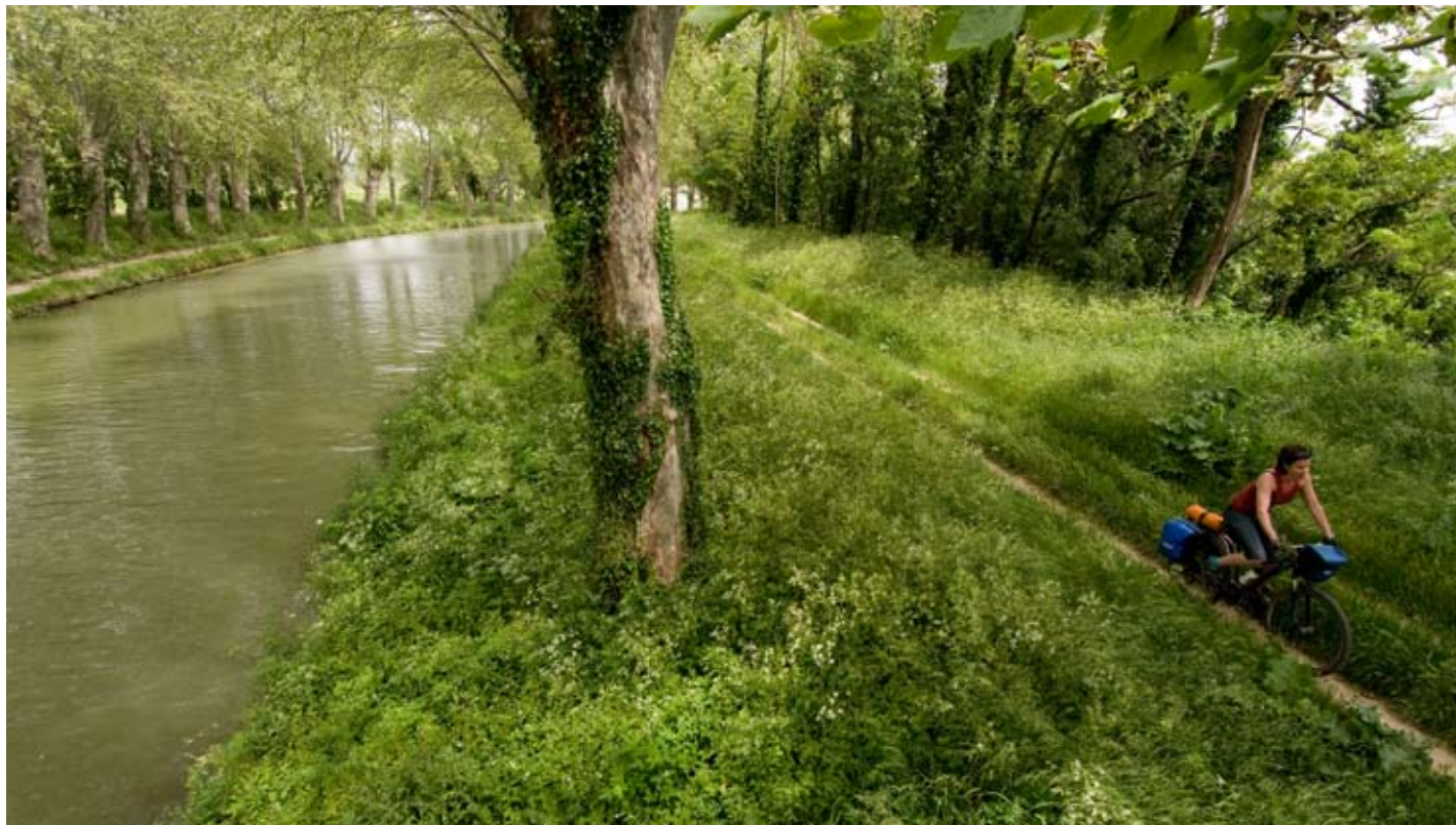
Canal cruising. Pedaling the bucolic track alongside the Canal du Midi in southern France.

is that longer chainstays allow the rear panniers to be placed more in front of the rear wheel axle, for improved weight distribution. But there's more to it than that.