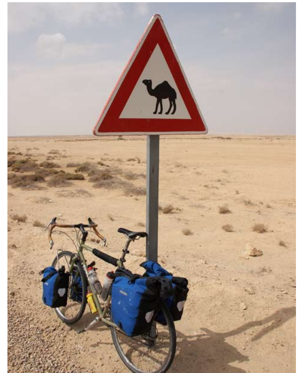
The places you’ll go. You’re more likely to see a camel than another cyclist in Tunisia.

an upright-handlebar bike designed for touring, so upright bar riders are forced to pick among mountain bikes and hybrids, some of which don’t have all the touring attributes you want. In particular, look suspiciously for traditionally-laced steel spokes, all-metal construction, and rack/fender mounts.