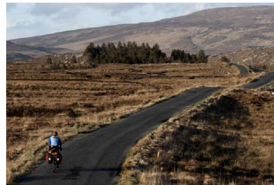
Out there. Exploring the low-traffic byways of Donegal County, Ireland.

These days it seems you must have to have an eagle's eyesight plus an obsession with racing chic to be a bicycle product manager because almost all bikes not marketed specifically for touring have an odd fashion attribute: minimal tire clearance. Bikes that the companies know will go to 60-year-olds doing charity rides have just enough clearance for skinny racing tires. No one can see this from more than a few feet away, and no one but the product man-