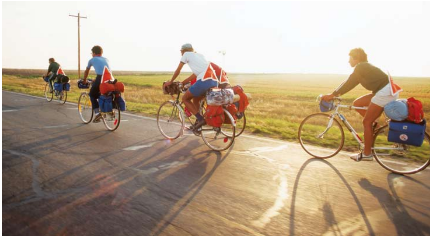
Bikecentennial 76. On the historic ride, people rode whatever bikes were in their garage, and they all worked pretty well as “touring bikes.”

tour and discovered the hard way that goofball spokes can ruin a bike trip.